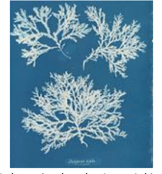
Delesseria alata by Anna Atkins. Image: New York Public Library.

Ultraviolet light waves have enough energy to break the bonds of chemicals, like the dyes in paper. This changes the paper's color. Sun prints work by shielding areas of the paper from sunlight. These areas remain the original color while the rest of the paper gets lighter.