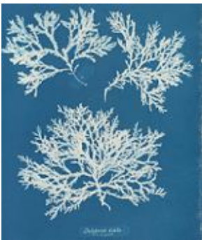
Delesseria alata by Anna Atkins.

Ultraviolet light waves have enough energy to break the bonds of chemicals, like the dyes in paper. This changes the paper's color. Sun prints work by shielding areas of the paper from sunlight. These areas remain the original color while the rest of the paper gets lighter.