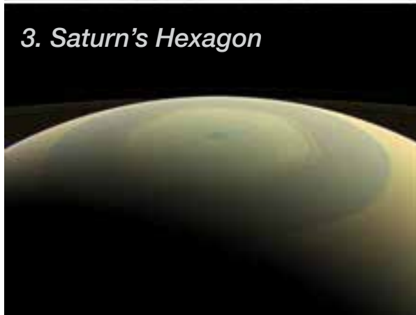
3. Saturn's Hexagon