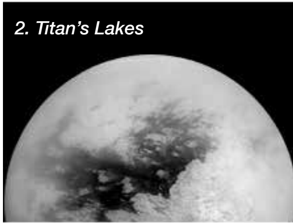
2. Titan's Lakes