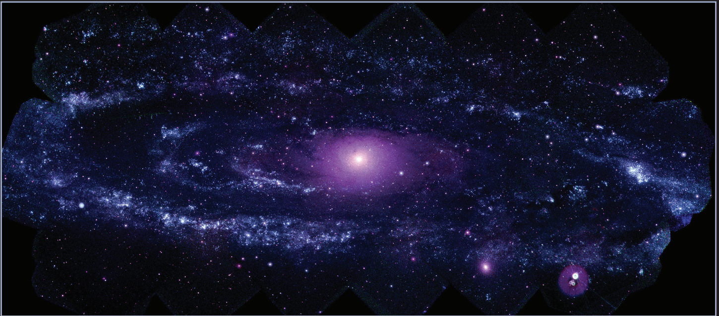
This mosaic of M31 merges 330 individual images taken by the Ultraviolet/Optical Telescope aboard NASA's Swift spacecraft. It is the highest-resolution image of the galaxy ever recorded in the ultraviolet. The image shows a region 200,000 light-years wide and 100,000 light-years high.