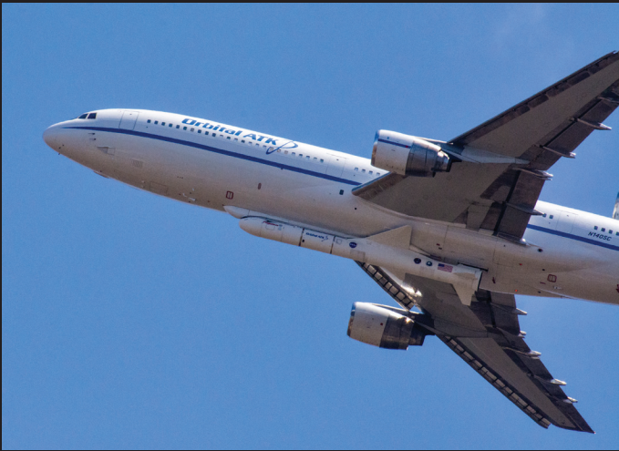
Northrop Grumman's Stargazer, a modified L-1011 aircraft, soars upward after takeoff from Vandenberg Air Force Base in California. The company's Pegasus XL rocket, carried beneath the aircraft as shown here, will launch Katalyst's LINK spacecraft.