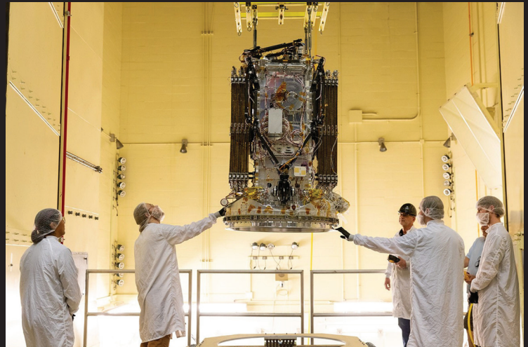
Engineers from Katalyst stabilize their LINK robotic servicing spacecraft as it moves into a vibration chamber at NASA's Goddard Space Flight Center in Greenbelt, Md., on April 15, 2026. The vibration chamber simulated the intense shaking LINK will experience during launch.

Swift studies gamma-ray bursts, the most powerful explosions in the universe, and other cosmic objects and events. In the more two decades since its launch, Swift has become a key part of NASA's strategy for studying fleeting and unpredictable changes in the sky from a variety of sources. With its versatility and rapid follow-up capabilities, Swift has enabled the discovery and localization of previously unknown cosmic targets. NASA then follows up these discoveries using different space telescopes, along with ground-based facilities from other agencies, to help us better understand how the universe works. By boosting Swift's orbit, NASA will retain the observatory's unique capabilities at a fraction of the cost of designing and building a new mission.