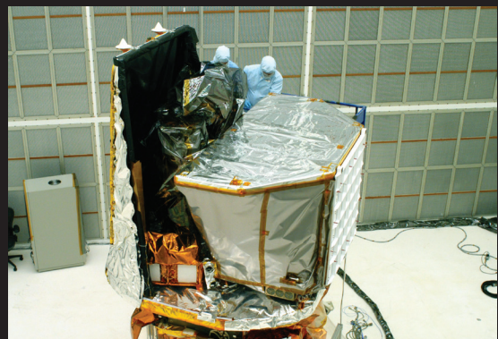
In July 2004, technicians in Hangar AE at what is now Cape Canaveral Space Force Station, Fla., remove the final pieces of protective covering from the Swift spacecraft in preparation for its November 2004 launch.