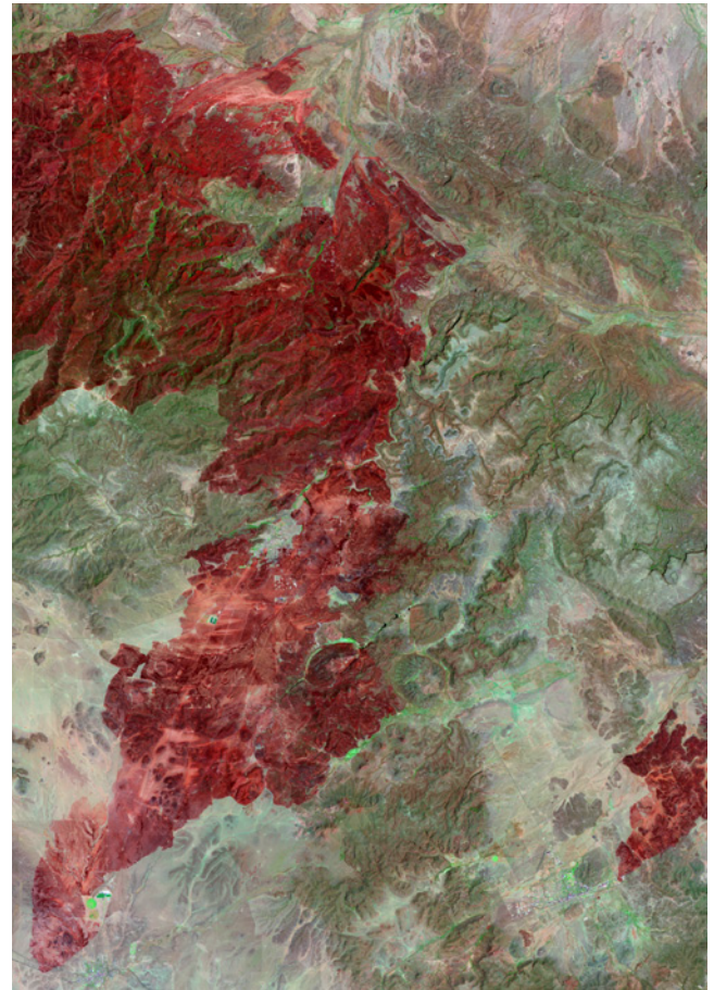
Newly burned land is dark red in this Landsat image of the Rockhouse Fire in Texas taken on May 2, 2011. Lighter red tones indicate less severe damage, while green and tan areas are untouched.

LANDFIRE, a vegetation, fire, and fuel characteristics mapping program run by the Forest Service and USGS, uses Landsat data to assess landscapes' susceptibility to wildfires. Downed vegetation in a forest can become fuel for a fire. LANDFIRE can help determine when a prescribed burn is needed to reduce fuel so that a larger, more intense and potentially more destructive fire does not occur.