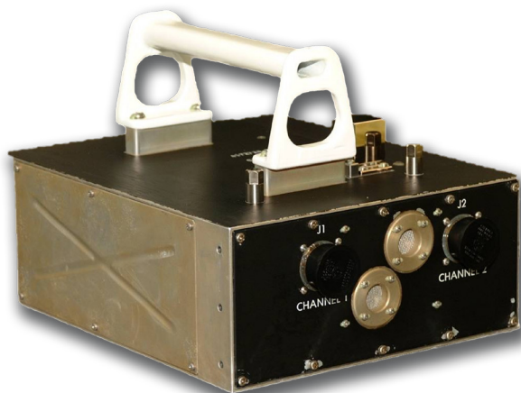
Rate Sensor Unit

Hubble's gyros are extraordinarily stable and can detect extremely small movements of the telescope. Hubble can lock onto a target without deviating more than 7/1000th of an arcsecond. That's about the width of a human hair as seen from a mile away. When used with other fine-pointing devices, the gyros keep the telescope pointing very precisely for long periods of time, enabling Hubble to produce spectacular images of galaxies, planets, and stars and to probe to the farthest reaches of the universe.