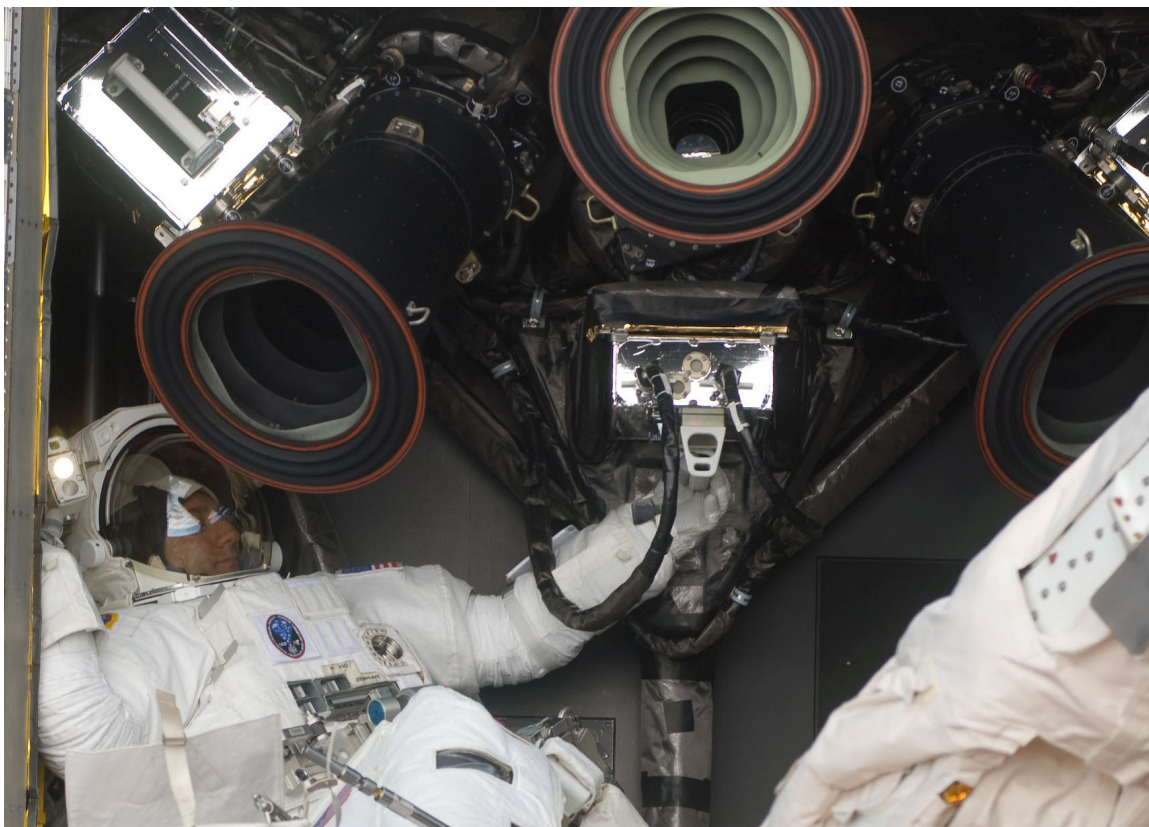
Astronaut Mike Massimino works to remove and replace Hubble's Rate Sensor Units, which contain the telescope's gyroscopes, during Servicing Mission 4 in 2009. All of Hubble's gyroscopes were replaced during the mission.

Each gyro is packaged in a Rate Gyro Assembly. The assemblies are packed in pairs inside boxes called Rate Sensor Units (RSUs). It is the RSU that astronauts change when they replace gyros, so gyros are always replaced two at a time.