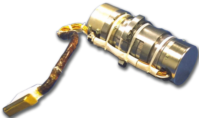
Rate Gyro Assembly