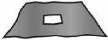
Diffraction Grating End