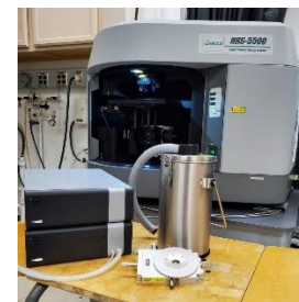
Above: FTRaman, FTIR, and DRIFTS station. In the FTRaman configuration.