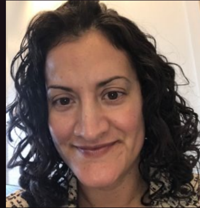
Director of Planetary Research (acting)