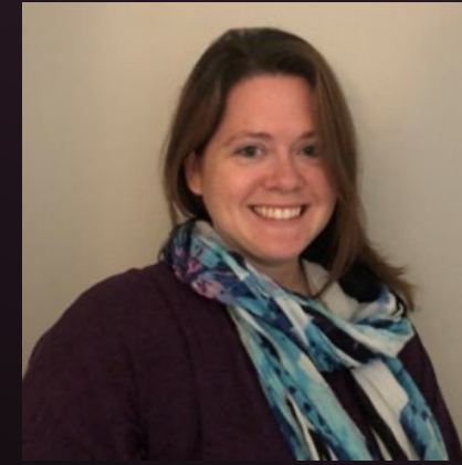
Deputy Director of Planetary Research (acting)